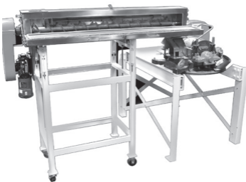
7-ft. Cryogenic Tunnel with Model C Pulva-Sizer™ 40-75 HP