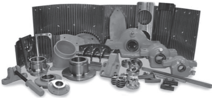
Parts for all major hammermill brands